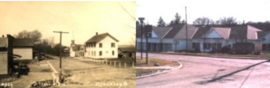
Left: Town Hall circa 1900; Right: Town Hall today

"As the pioneers from the East began to move westward, the Judge was quick to place his holding in other parts of the Western Reserve for sale. He was in no particular hurry to dispose of his Hinckley holdings because they were of less value and Hinckley remained a wilderness for quite a while after adjoining townships had been settled."